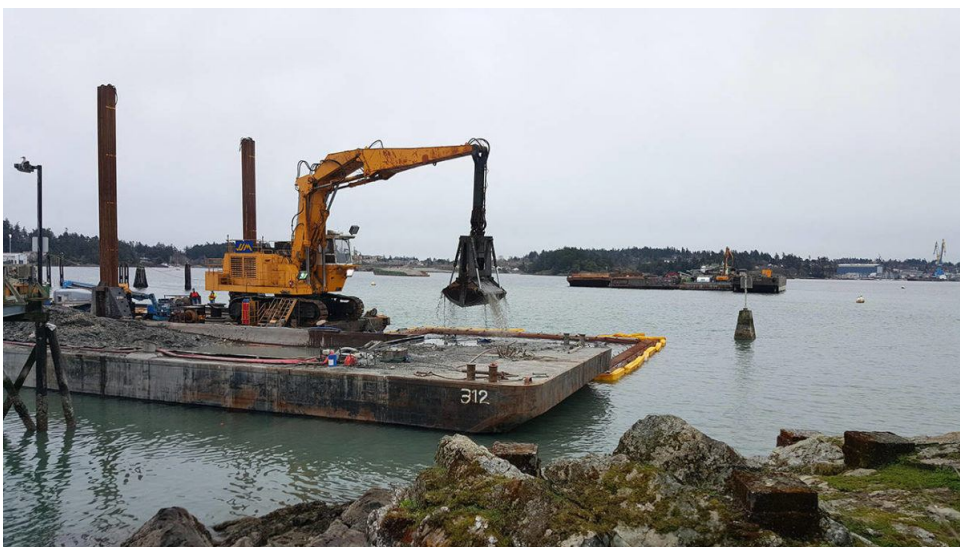
An excavator dredges sediment from the Esquimalt Harbour.

The first submission of artifacts has arrived at the RBCM and provides an exciting preview as the collection starts to take shape. Below we have selected a sampling of artifacts and some of their significance.