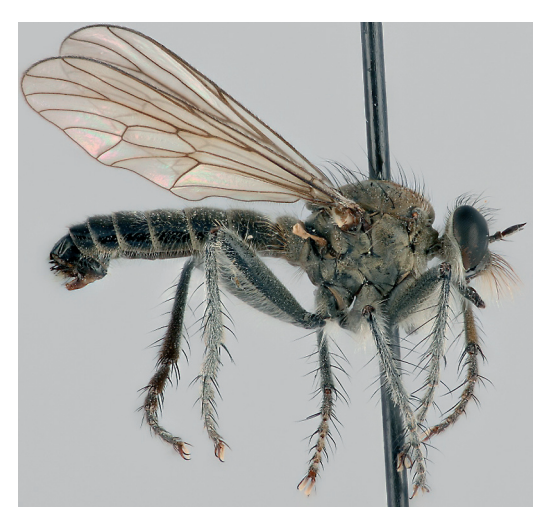
Fig. 4. Lasiopogon septentrionalis female, lateral view. Utsjoki, Pulmankijoki, 5.VII.2004. Deposited in coll. J. Kahanpää.

Acknowledgements. We thank Arkady Lelej (Institute of Biology and Soil Science, Vladivostok) for confirming