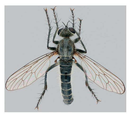
Fig. 3. Lasiopogon septentrionalis male, dorsal view. Finland, Utsjoki, Fierranjohka, 6.VII.2004. Deposited in the Finnish Museum of Natural History (MZH).

ation is not unexpected, because the colour of setae in some Lasiopogon species is often variable, and in some species with wide ranges there is a cline of setae colour. Such variation occurs also in other asilids, such as Rhadiurgus variablilis , which ranges from Scotland through Siberia and Alaska to Newfoundland. In this case the flies are considerably darker in North America than they are in Europe (Cannings 1993).