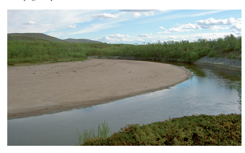
Fig. 2. Habitat of Lasiopogon septentrionalis at Pulmankijoki in northern Finland (photo by Maria Haakana, 20.VI.2004).